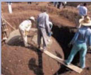
A concrete dome has a capacity of up to 66,000 litres.

SG 2000 water harvesting activities are underway in Oromia, Amhara and Southern regions (see table). The demonstration sites are located in a total of eight woredas (administrative districts) and close to US$ 40,000 will be invested to establish these pilot demonstrations.