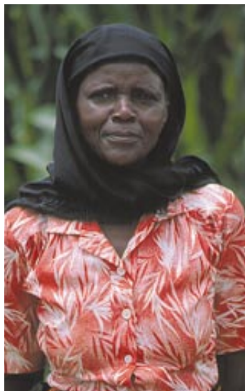
SG 2000 has a long history of working with farmers in Tanzania.

SG 2000 continues to work with the Ministry of Agriculture and Food Security (MAFS), in preparation for a new World Bank-funded project, Participatory Agricultural Development Project (PADEP), which will support a range of community-based initiatives to enhance agricultural productivity and conserve the natural resource base. It is expected that PADEP will become effective by July 2003. With its long history of working with extension officers and farmers in seven regions of the country, MAFS extension and crop production officers have sought SG 2000 collaboration to assess a range of new productivity enhancing and resource conserving technologies.