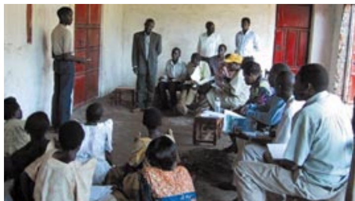
One Stop Centres will help to train rural communities in agroprocessing activities.

Uganda's food security status is currently stable with "appreciable amounts of grain being procured internally for areas affected by civil unrest in parts of northern Uganda," reports country director Abu Michael Foster.