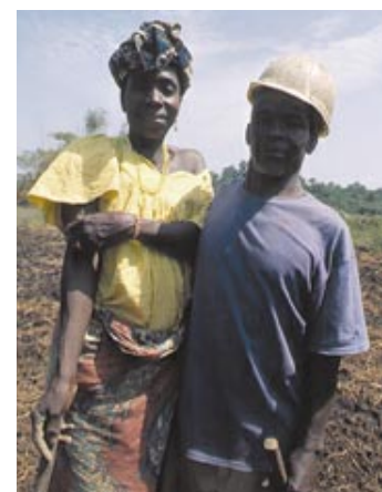
Field activities in 2002 involved over 5,000 farmers' plots.

Guineans," he says, "but we know that this will only happen through training and technical support, allied to a strengthening of the necessary agricultural institutions." Close co-operation has therefore been developed with extension research in four of the country's research centres, with three schools of agriculture, and with the University of Faranah, Guinea's leading agricultural university.