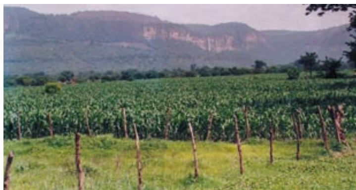
Part of a 50 ha QPM field in Dittin, Mamou region