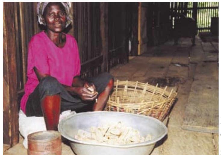
Maize was the most important demonstration crop, by commodity, in 2002.

The SG 2000 Ghana programme is scheduled to come to a conclusion at the end of 2003, after 17 years of operation, although selected activities will continue to be supported through regional SAA and SG 2000 initiatives. During 2003, SG 2000 plans to continue its agribusiness skill development by offering follow-up training to 19 groups trained in 2002 and to offer training to 15 additional groups. The programme will also focus on post-harvest technology transfer and agroprocessing micro-enterprise development.