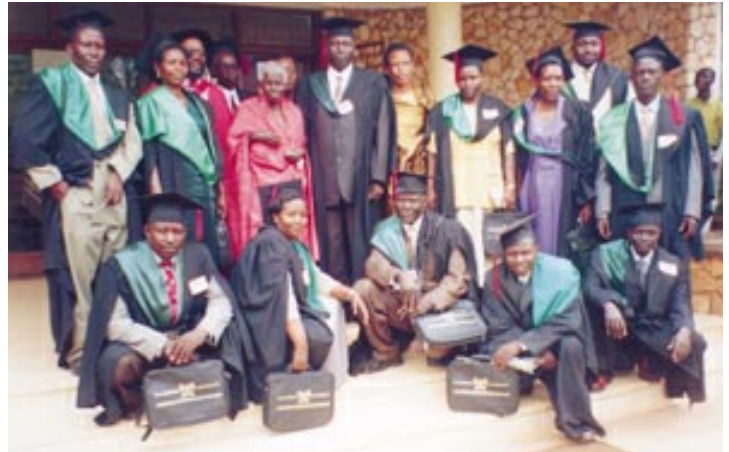
The third group of mid-career extensionists graduates from Makerere University, Uganda.