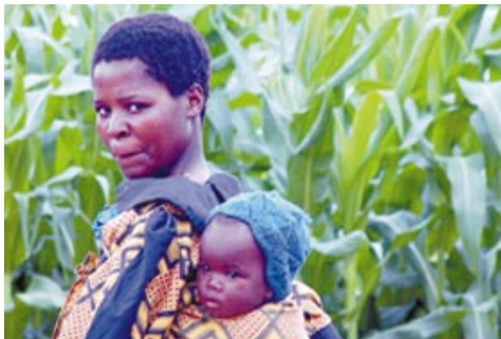
SG 2000/ADDs have established over 6,000 maize MTPs in 2002/03.