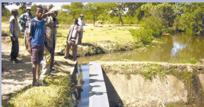
Small-scale surface irrigation using shallow aquifers, rivers and streams.

Of Ethiopia’s 69.1 million inhabitants, 85 percent are subsistence farmers. SG 2000 was introduced to the country to demonstrate to smallholder farmers and government officials how improved technologies could greatly enhance food production in relatively