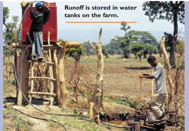
Runoff is stored in water tanks on the farm.

In executing this programme, SG 2000 is also collaborating