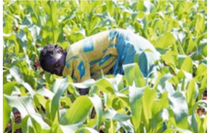
Farmers are enthusiastic about the labour-saving benefits of conservation technology.