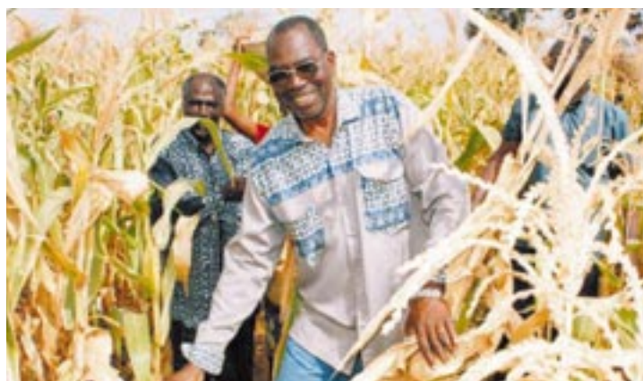
A delegation of MPs visits the Cascades region to learn about the benefits of small-scale irrigation.

Despite the late start to the rains in 2002, the seasonal average of 807 mm in the eight regions where SG 2000 is active compared favourably with 811 mm in 2001, judged to be a good year. Cereal production in 2002 reached 3.12 million t, with record maize production at 610,000 t. Cotton production was also a record. The country's only deficits were in wheat and rice production, with net imports declining.