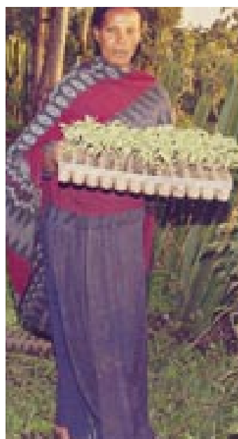
A farmer in Arsinegele receives horticultural seedlings from SG 2000.

Averting the food crisis and trying to reduce poverty are priorities for the Ethiopian government, led by Prime Minister Meles Zenawi. Over the last few years, hundreds of thousands of smallholder farmers have been provided with improved agricultural technology in high potential areas of the country – and US$ 12 million has been allocated for the purchase of fertilisers in 2002.