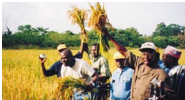
Rice harvesting at a multiplication site in Bareng, Guinea

Dr Asanuma was impressed with the level of enthusiasm among farmers, but posed the question,