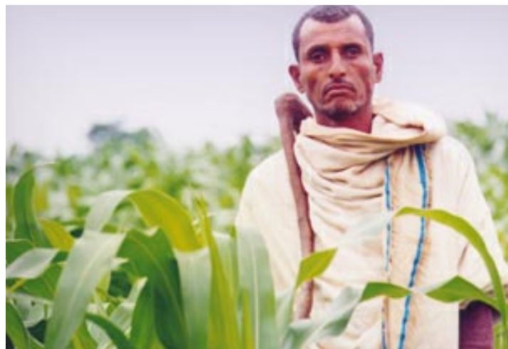
Nearly half of all on-farm demonstrations in 2002 involved conservation tillage.

SG 2000 continues to provide support for government extension and research programmes. Strategic interventions include the promotion of improved crop varieties, such as rice and soybean, simple farm implements, postharvest activities and fertiliser studies.