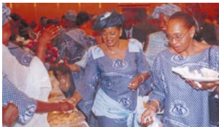
Mali’s First Lady (centre) samples dishes prepared from QPM on Women’s Day.

New programme activities have involved the country’s youth. In partnership with the Foundation for Africa, a group of 12 young men and three young women, aged 12 to 18, have been selected to participate in a one-year training programme involving agricultural technology and formal literacy education. The main school in Sanankoroba, near Bamako, made a classroom available. Practical training in the field is reinforced by agricultural education by SG 2000 staff. For each day of field work, the students receive a US$ 1.50 stipend. The programme is set to expand.