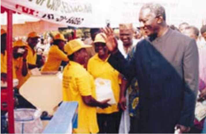
President John Agyekum Kuffour, accompanied by ministers of state, visits the SG 2000 stand at the Annual Farmers' Day.

The agriculture sector in Ghana grew at four percent in 2001, about double the rate of 2000. Low use of improved production inputs, such as fertilisers and improved seeds, is still negatively affecting farmers' yields. Fertiliser use in Ghana is lower today than it was 20 years ago, despite a 60 percent increase in total population. Food production is increased through area expansions. Average yields of all major staple crops have been declining for the past five years.