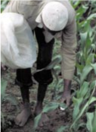
There has been an excellent response to fertilisers in all SG 2000 countries.

Mineral fertiliser use in Sub-Saharan Africa (SSA) is the lowest in the world (Figure 1). On average, less than 5 kg/ha of fertiliser nutrients are applied to food crops, even though population pressures have caused traditional systems of shifting cultivation to break down. Soil nutrients are being depleted at an alarming rate, leading to environmental degradation and food insecurity.