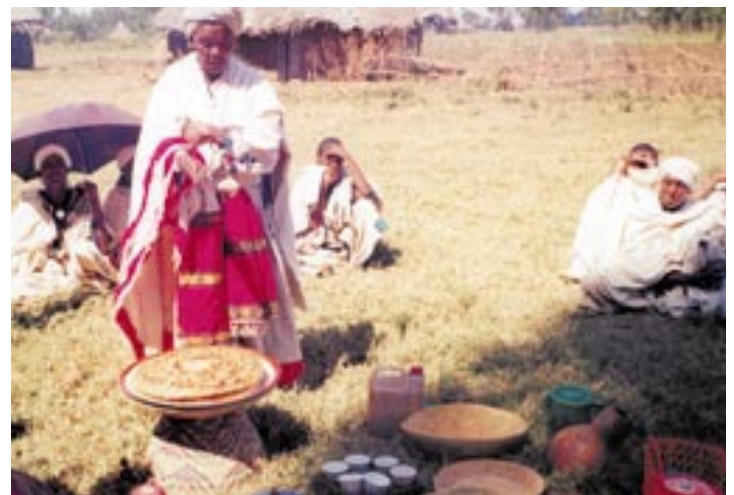
Women from Oromiya Zone demonstrate food preparation from rice to women from Wereta District, South Gonder Zone.

“Government officials at all levels are talking seriously about the need to transform peasant agriculture into market-oriented commercial agriculture,” says Takele Gebre. “There is a real momentum behind this with agricultural, technical and vocational schools training thousands of young people to become specialised smallholder commercial farmers.”