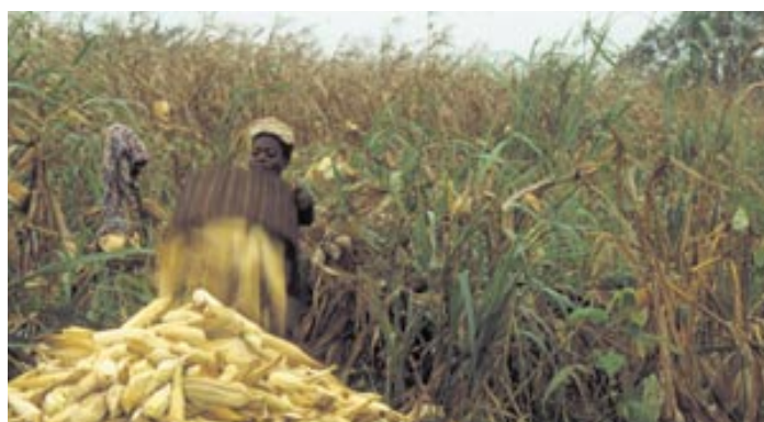
Technology exists to double and triple maize yields.

Maize is the most widely grown food crop in Sub-Saharan Africa (SSA). It is planted on 100,000 ha or more in 24 countries, and in total, is grown on about 21 million ha (Table 1). It accounts for 41 percent of the total cereal area in Eastern and Southern Africa and 21 percent in Western and Central Africa. Maize is primarily used for human consumption. Its caloric contribution to national diets ranges from a low of 4 percent in Guinea (where rice is the primary staple) to a high of 54 percent in Malawi.