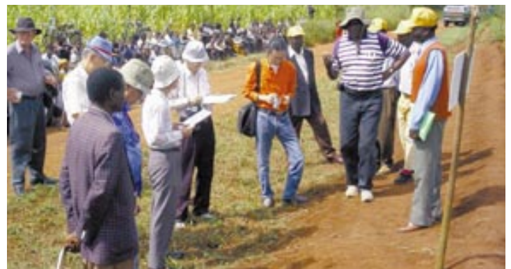
The evaluation team visit Lilongwe Agricultural Development Division (ADD).

Matsumoto: Yes, it is possible. But you can't simply compare African countries with other