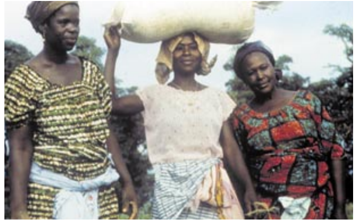
Perhaps 40 percent of the world's population are alive thanks to chemical nitrogen fertilisers.

“By all means, use all available organic sources of nutrients,” says SAA President Norman Borlaug, “but also remember that perhaps 40 percent of the present world population are alive thanks to chemical nitrogen fertilisers. There just isn’t enough organic fertiliser available to replace the 80 million nutrient tonnes of nitrogen fertilisers consumed worldwide each year.”