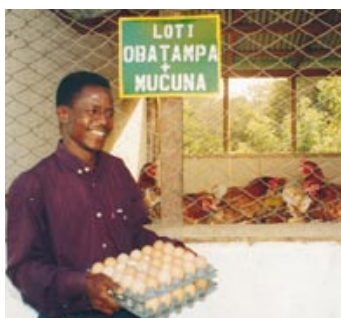
Eggs from 33 percent replacement of fish meal by Mucuna meal.