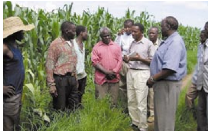
SG 2000 field visit to Mbeya rural.

SG 2000 staff worked with Tanzanian extension workers and smallholder farmers to establish 48 demonstration plots in six regions using rock phosphate from