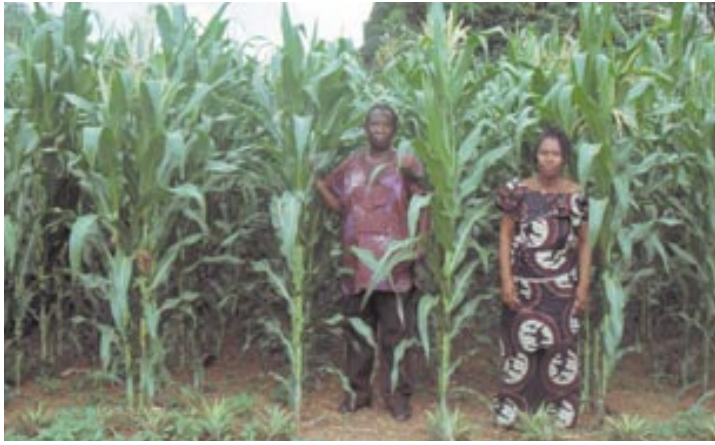
Over 400 farmers have received credit to produce Quality Protein Maize commercial plots.

Ghana had good rainfall during 2002. Over 30 wet days have already been recorded in the southern part of the country. The relatively drier northern parts of the country have also received an average of ten days of rainfall, adequate to facilitate tillage operations.