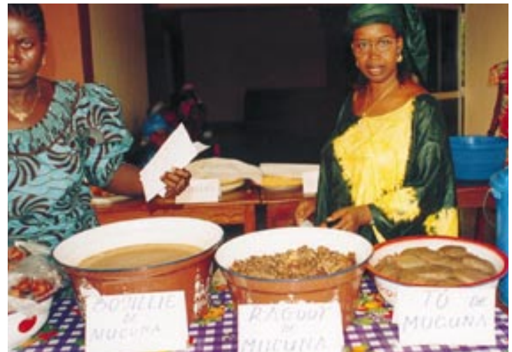
Over 1,900 women have been trained to prepare recipes using Mucuna.

During the year 2000, SG 2000 collaborated with two schools of agriculture and livestock in studies using Mucuna seed as a component of poultry feed ration. Fishmeal was substituted at a level of 33 percent with detoxified Mucuna seeds. Mucuna fed hens not only grew normally, but