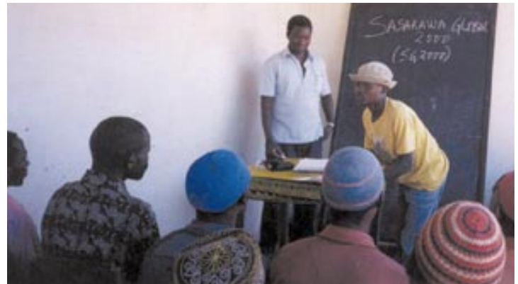
SG 2000 In-Service Training provides technology transfer to farmers at the grass roots level.

eight on-station sites (see Table 2). The four QPM entries competed well with the two commercial normal varieties, Manica-SR and Matuba.