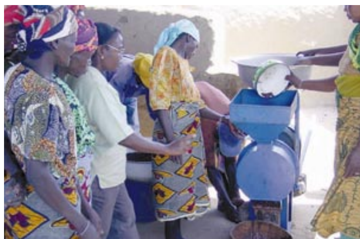
In Northern Ghana, women farmers are using wet-type grinders to process shea-nut butter.