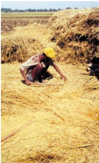
A farmer from Oromiya Zone in Amhara Region threshes his rice crop.

Ethiopia's ambitious plans for agriculture appear to have made a major contribution to the economic development of the country. According to the Economic Report on Africa, released recently in Addis Ababa, real GDP growth has averaged 6 percent from 1992 to 2001—amongst the highest on the continent. Exports have increased by 5 percent. Annual inflation has been kept down to 4 percent while investment has grown by 16 percent.