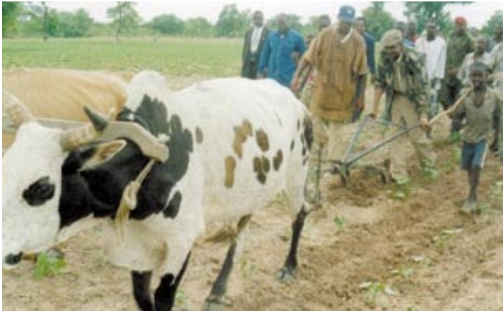
Amadou Toumani Touré, Mali's Head of State, tries out a plough on an SG 2000 site in Koumantou, southern Mali.

Following adequate rainfall in 2001, Mali's rains in 2002 have been disappointing. Four operating regions of the SG 2000/Ministry of Rural Development (MRD) programme were affected, with Sikasso showing the greatest deficits (Table 1).