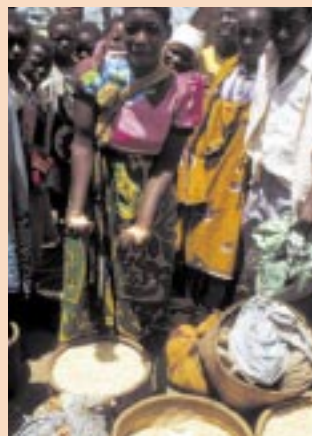
Women farmers will be given particular emphasis.

The workshop will provide a forum to share experiences and good practices as well as identifying possible