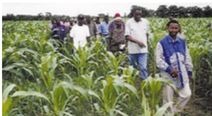
Burkina Faso's Minister of Agriculture, Water and Fisheries, Salif Diallo, visits a Masongo (QPM) Plot under small irrigation in Hauts Bassins.

The rains were delayed in 2002, with five of the eight agricultural regions in which SG 2000 is working receiving significantly less rainfall than in 2001. Particularly hard hit were the regions Boucle du Mouhoun, with a deficit of 122mm compared with last year, and Centre Ouest, with a deficit of 100mm. Thirty-five villages in the two regions were adversely affected.