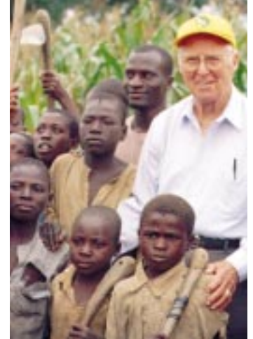
Dr Norman E Borlaug, SAA President