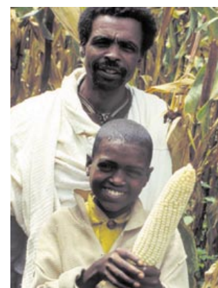
Maize is the most widely grown food crop in Sub-Saharan Africa.

utilisation for poultry and livestock feeding can expand commercial market demand. More maize can also be used in starch manufacture and food processing (cereals and snack foods). In addition, maize can be substituted for imported barley as the carbohydrate source in beer, thus saving scarce foreign exchange. Finally, expanded maize trade between African countries is another option, if yields can be raised and transport costs lowered.