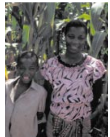
SG 2000 plans to introduce new QPM varieties in 2000/3.