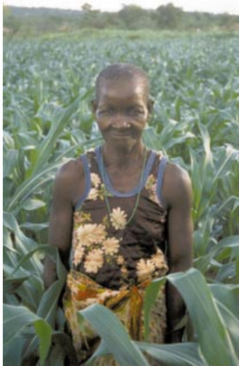
A proud farmer in her well fertilised maize field.

Like many countries in southern Africa, Mozambique has suffered from a shortage of rainfall. This has affected production in the main agricultural zones of the country. In the central region, drought has been a major problem. In the north, planting was delayed by six to eight weeks due to the late onset of the rains. There are food deficit pockets in the southern parts of Sofala and Manica Province, areas of Tete and the coastal region of Nampula. However, overall, less than five percent of the population has been affected.