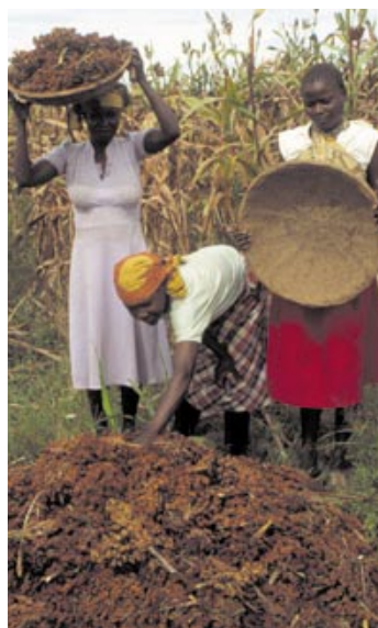
African agriculture must grow at 5 to 6 percent per year to ensure food security.

It has been amply demonstrated that chemical fertilisers, when properly used, are not only beneficial for productivity enhancement but are also environmentally friendly. By permitting production on the same land, migration of farmers to marginal soils in search of plant nutrients is prevented. Increasing fertiliser use in Africa is surely not an environmental problem but rather a central component in SSA's environmental solution.