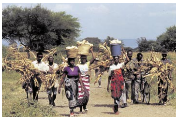
African smallholders are often forced to sell maize for 30-50 percent less than OECD farmers.