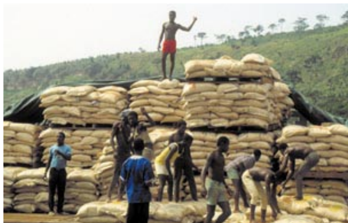
More efficient delivery systems could reduce the cost of fertilisers for African farmers.

This is not because fertilisers do not work or due to a lack of high-yielding, fertiliser-responsive varieties. To the contrary, SG 2000 staff and Ministry of Agriculture colleagues have observed excellent agronomic response to fertilisers in 12 countries on several million demonstration and production plots.