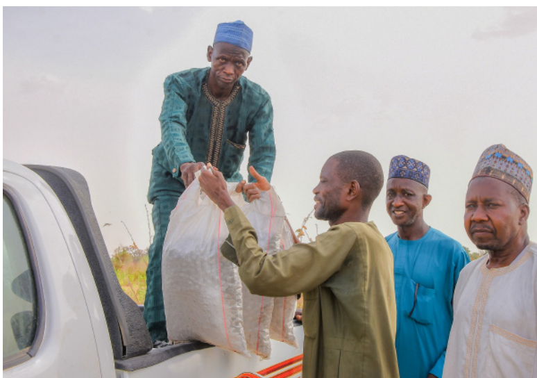
A beneficiary of the project receives input from a seed company

Council (NASC) for certification and also ensure that the farmers manage their fields. Besides, they get the inputs free – both seeds and other agro-inputs. In that regard, the project and the donors have done very well.