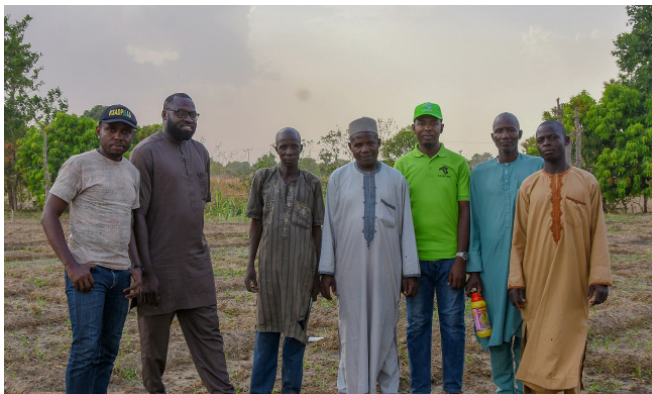
Group photograph of KSADP/SAA team with EAs and CBFs