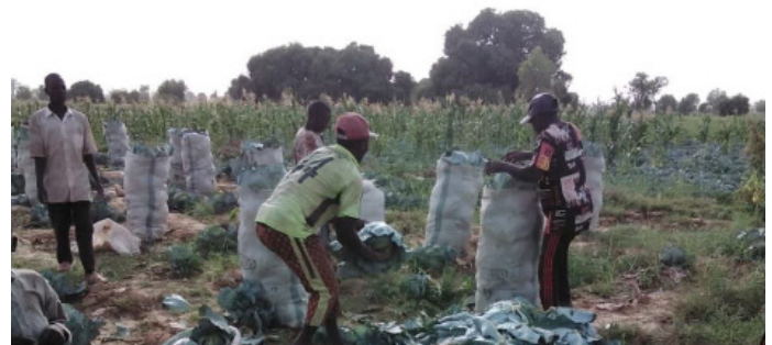
Farmers harvest dry season cucumber demo plot

THIS NEWSLETTER IS PRODUCED BY SASAKAWA AFRICA ASSOCIATION IN COLLABORATION WITH THE KANO STATE AGROPASTORAL DEVELOPMENT PROJECT (KSADP).