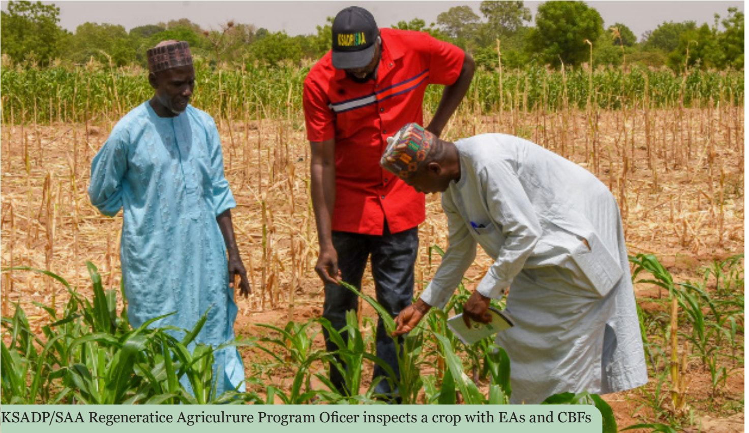
KSADP/SAA Regenerative Agriculture Program Officer inspects a crop with EAs and CBFs

During the establishment of a Community Based Seed Multiplication (CBSM) plot in Garko Local Government Area, farmers around the host farmer were fascinated about the improved methods and seeds being used. However they considered the process too meticulous and did not think that the effort would yield commensurate results. But just weeks after the plant was established, they started to enquire about how to get the seeds and be part of the project.