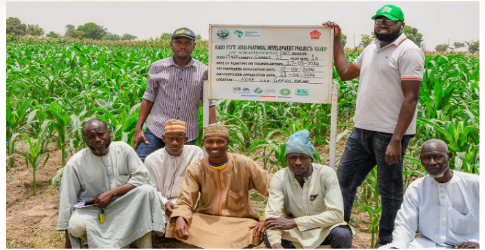
Group photographs with the host farmer of a CBSM plot in Garum Mallam LGA, Kano.