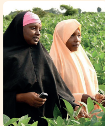
Supporting resource-poor farmers – such as women and youth

The Sasakawa Africa Fund for Extension Education (SAFE) was launched at the University of Cape Coast nearly 20 years ago. Focused on building the skills of mid-career extension professionals, over 4,000 are benefitting from this program which now involves 17 universities and colleges across Africa.