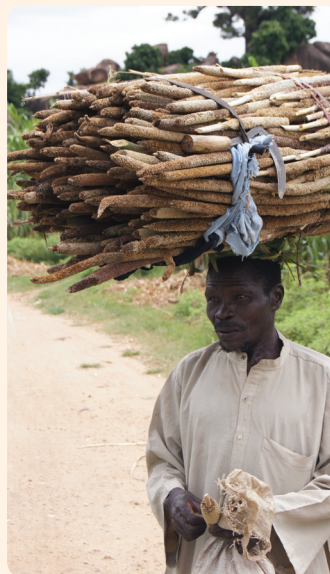
Nigerian farmer transporting pearl millet from his field to the homestead

As an important part of this new strategy, the SAA has worked to diversify its funding services while continuing to rely on the constant and unswerving support of The Nippon Foundation. As a result, SAA activities in the field have