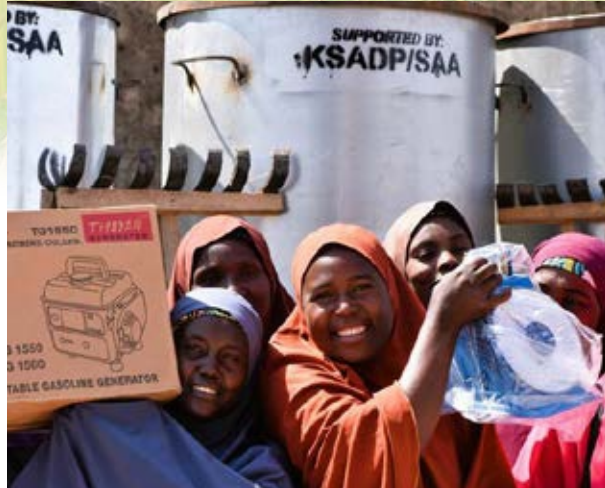
Beneficiaries of KSADP Rice parboiling kits in Kano