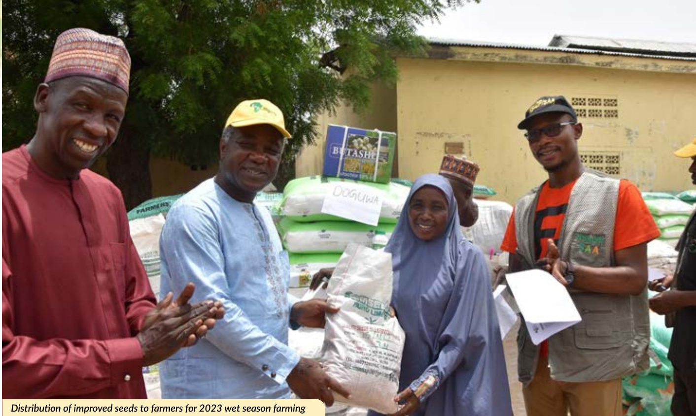
Distribution of improved seeds to farmers for 2023 wet season farming