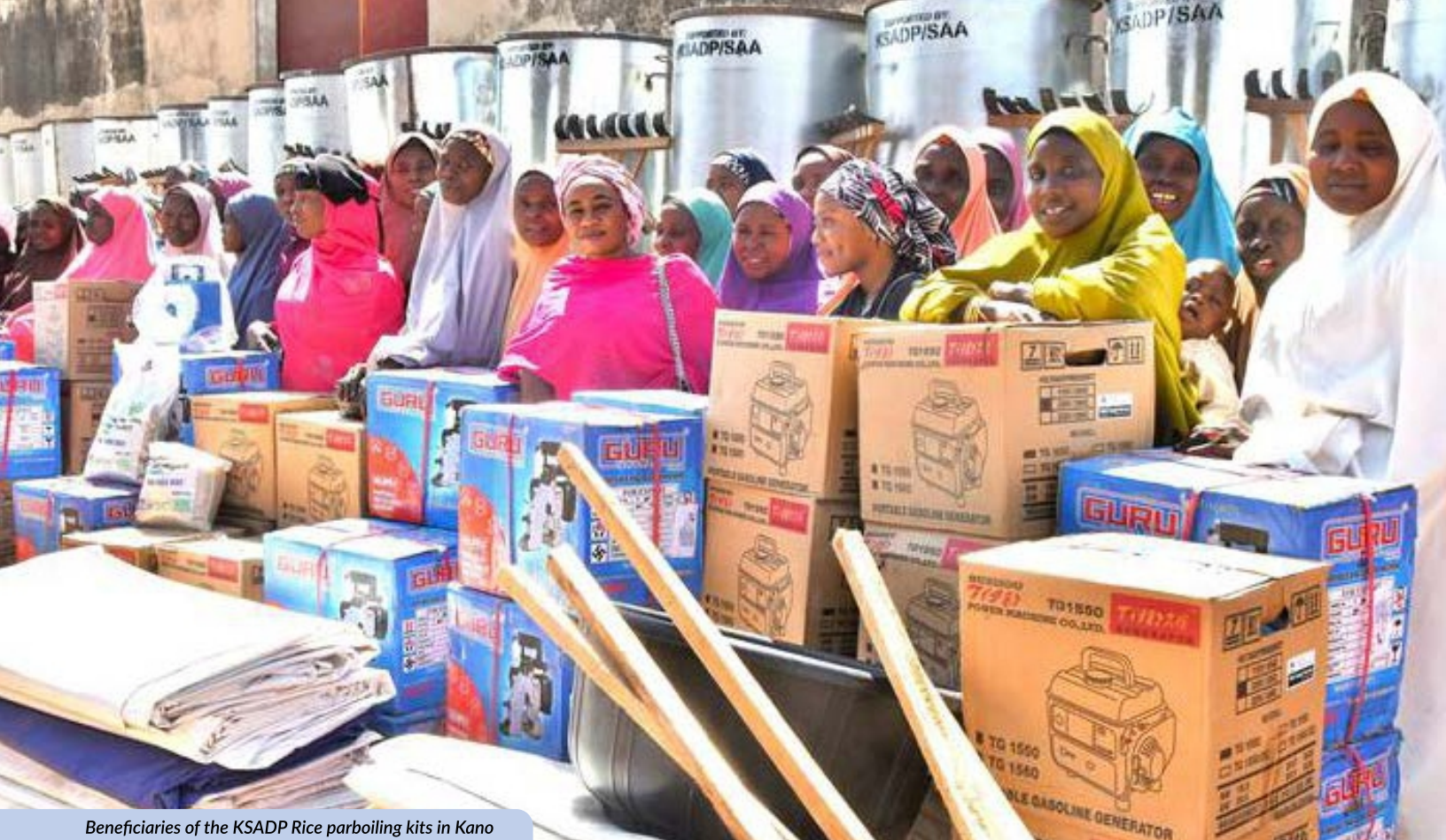
Beneficiaries of the KSADP Rice parboiling kits in Kano