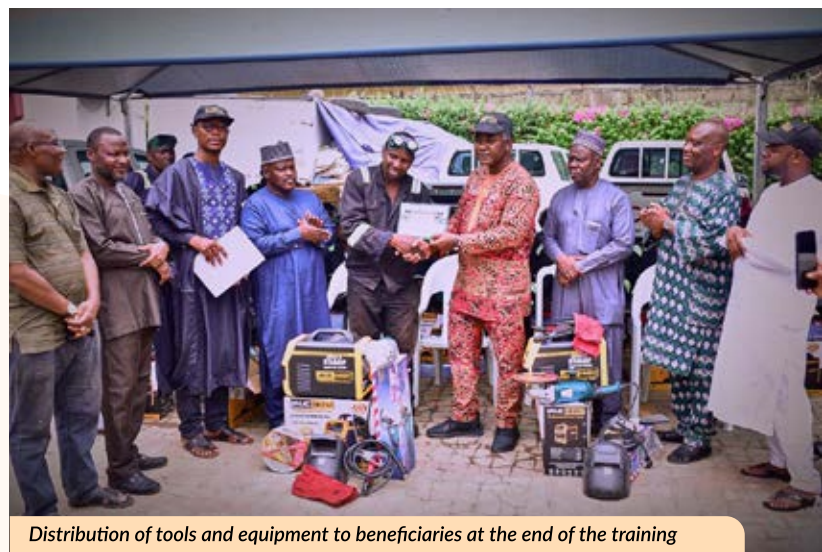
Distribution of tools and equipment to beneficiaries at the end of the training

At the end of the training, each of the participants was equipped with an Angle grinder for grinding and cutting metal plates and iron; a MMA 500 welding inverter, and personal protective equipment including safety boots, overalls, helmets, and gloves.