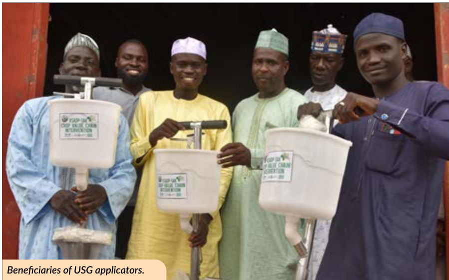
Beneficiaries of USG applicators.

When the Monitoring and Evaluation (M&E) team of the KSADP/SAA project embarked on a tour to assess the level of utilization and maintenance of the pre-and post-harvest equipment distributed to farmers across the state a few months ago, little did they know that the rate of utilization of some of the equipment would beat their expectations.