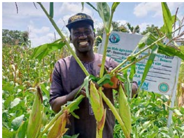
Beneficiary farmer during a KSADP green field day