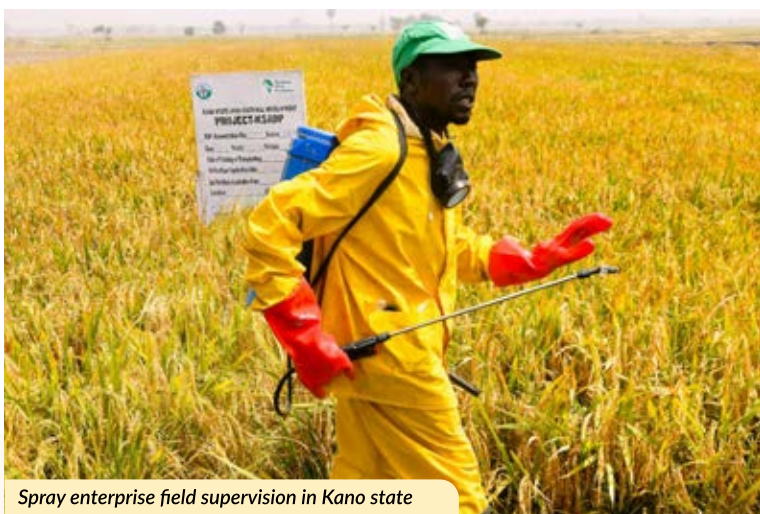
Spray enterprise field supervision in Kano state

The training also equipped the sprayers with entrepreneurial and financial skills to treat their service as business ventures.