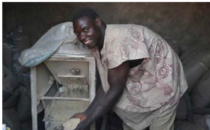
Rice Mill operator in Jobe community