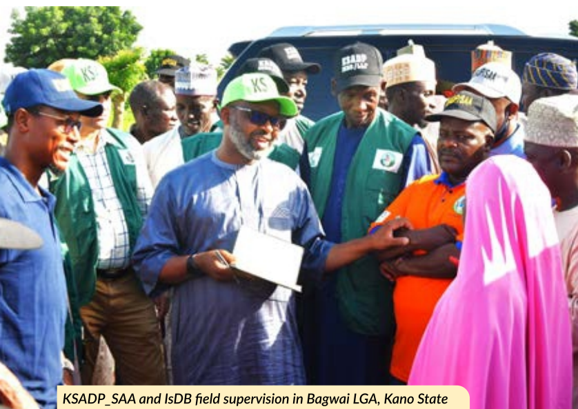
KSADP_SAA and IsDB field supervision in Bagwai LGA, Kano State