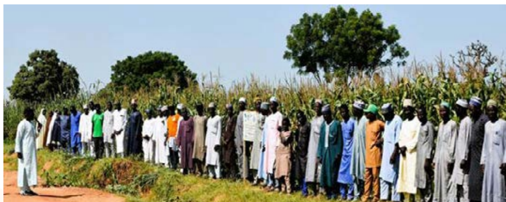
→ Green field day in Gwarzo Local Government

THIS NEWSLETTER IS PRODUCED BY SASAKAWA AFRICA ASSOCIATION IN COLLABORATION WITH THE KANO STATE AGROPASTORAL DEVELOPMENT PROJECT (KSADP)