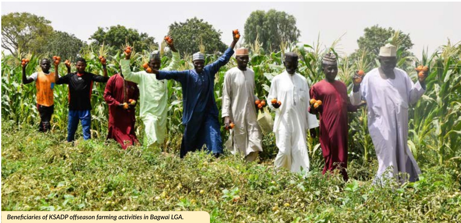
Beneficiaries of KSADP offseason farming activities in Bagwai LGA.

According to the Coordinator, these maize seed varieties are drought- and Striga-resistant seed varieties that are also efficient in soil nutrient utilization.