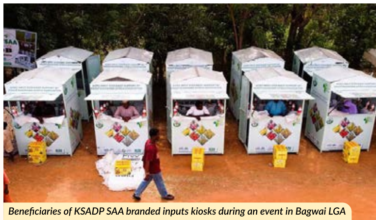
Beneficiaries of KSADP SAA branded inputs kiosks during an event in Bagwai LGA