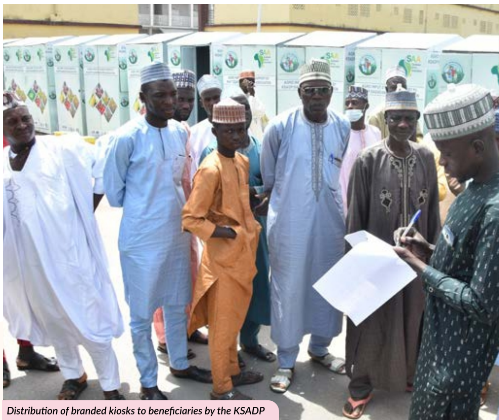
Distribution of branded kiosks to beneficiaries by the KSADP

A lot of the input dealers, which the programme refers to as “input stockists” have seen their customer base jump by more than 100% owing to the additional service they offer and the assurance that they only stock genuine and quality products.