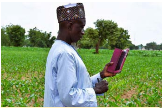
Data collection by KSADP/SAA Extension Agent in Boko Community

The KSADP/SAA collaborated with the National Agricultural Extension and Research Liaison Service (NAERLS), to train 88 Extension Agents and Community Association Traders (CATs) on the use of Information and Communication Technology (ICT) tools to effectively source, aggregate, and disseminate market information.