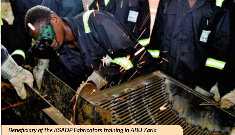
Beneficiary of the KSADP Fabricators training in ABU Zaria

"All these put together, will ensure that the presence of these skilled fabricators scales up local fabrication and make machines available and affordable."