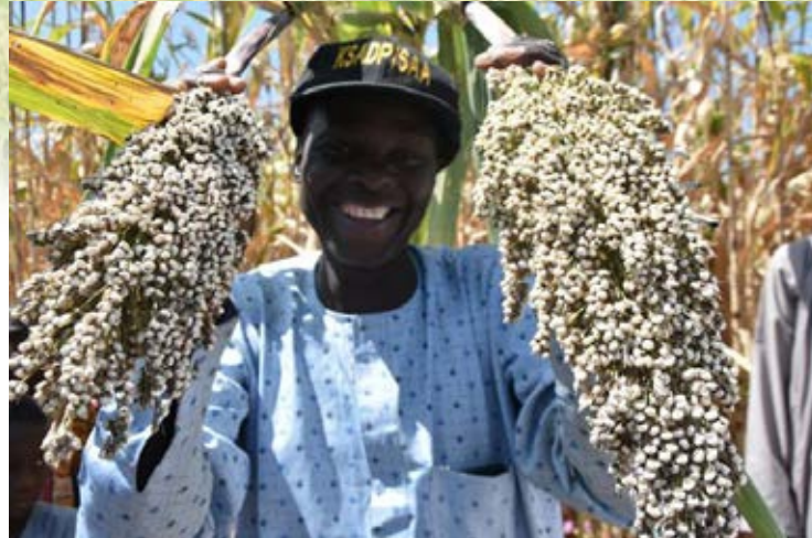
Beneficiary Farmer during Mega Brown field day in Gwamma community