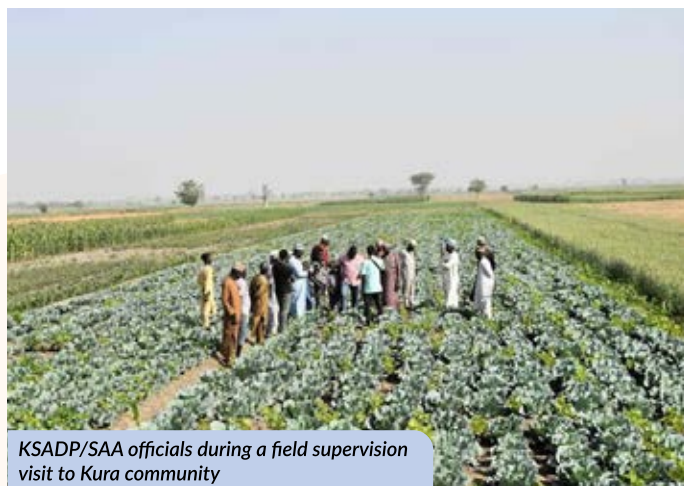
KSADP/SAA officials during a field supervision visit to Kura community

"The trainings have positively impacted a large number of farmer groups, who were educated and sensitized on how to develop their groups, manage and resolve group conflicts, have collective access to both input and output markets, and increase and manage group finances effectively," he said.